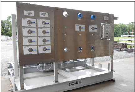
HIGH PRESSURE CHEMICAL INJECTION SKID – DEEP WATER OFFSHORE PROJECT