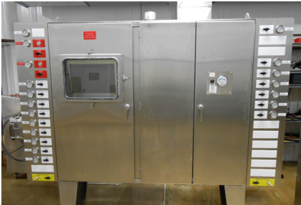
PLC CONTROL PANEL – OFFSHORE GULF OF MEXICO