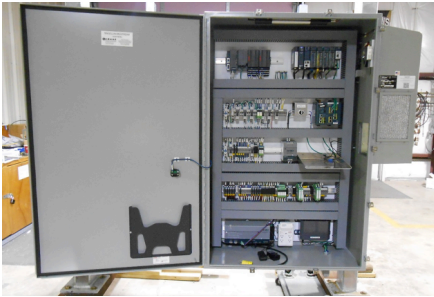
PLC PANEL ON SWITCH RACK – PIPELINE LOCATION